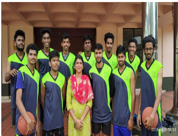
MEN BASKET BALL TEAM 2018-19