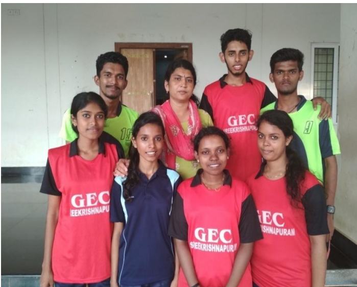
MEN & WOMEN TABLE TENNIS TEAM 2018-19