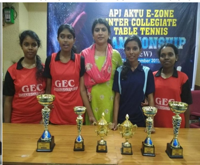
WOMEN TABLE TENNIS TEAM 2018-19 THIRD POSITION IN 'E' ZONE TOURNAMENT 2018-19