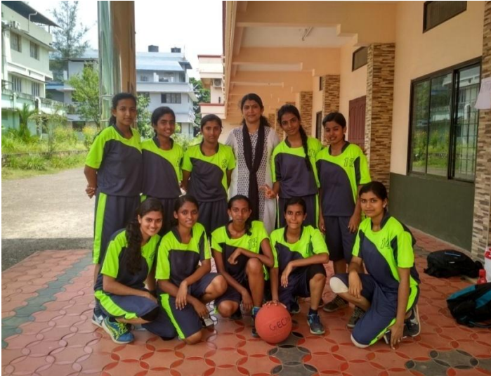
WOMEN HANDBALL TEAM 2018-19 (THIRD POSITION IN 'E' ZONE HANDBALL TOURNAMENT 2018-19)