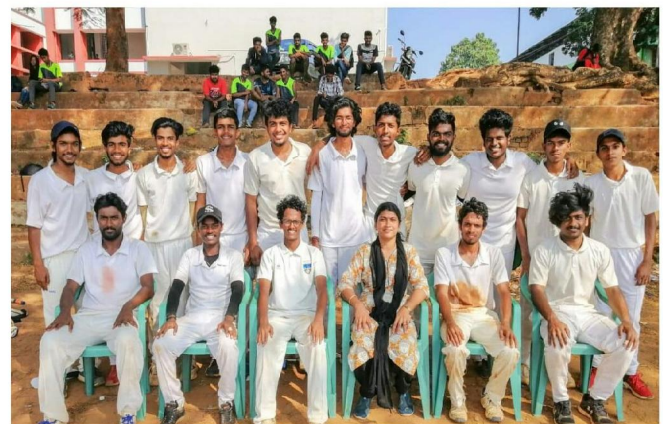
RUNNERS UP KTU E-ZONE CRICKET TOURNAMENT GEC PALAKKAD