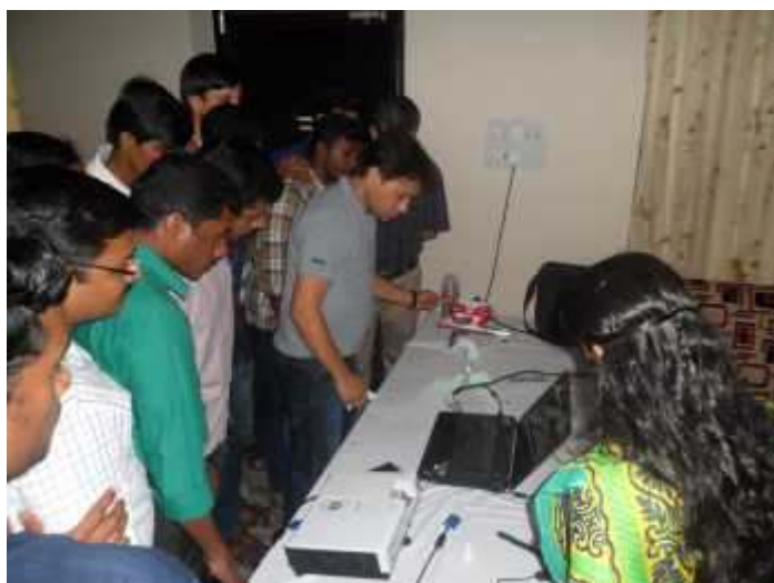
Fig: Demo on 3D printing and scanning