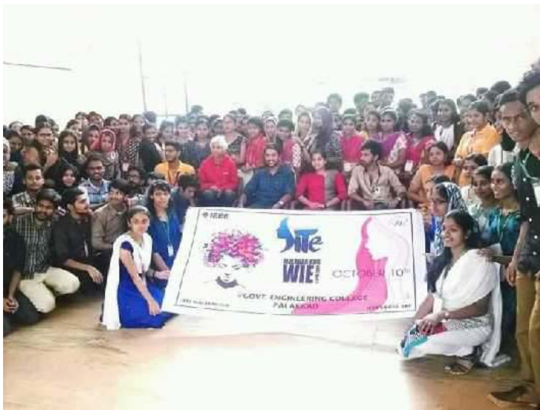
Women's Day Celebration